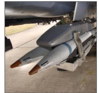
MPACT is ideal for next generation pneumatic racks.

MPACT is designed for easy integration into next generation single or multiple pneumatic bomb/ejector racks. MPACT can also be retrofitted to convert legacy pyrotechnic racks to pneumatic capabilities.