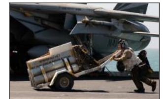
MPACT reduces logistics and high operational costs.