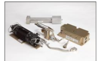
MPACT is ready for SDB and other platforms.