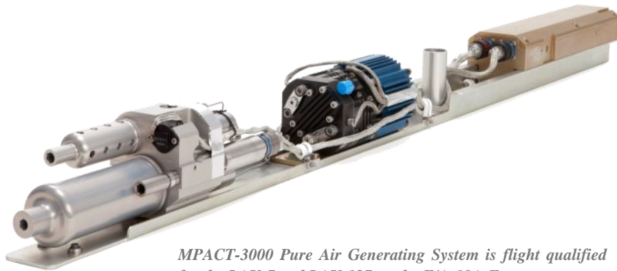
MPACT-3000 Pure Air Generating System is flight qualified for the LAU-7 and LAU-127 on the F/A-18A-F

MPACT-3000 is a proven, low risk solution for infrared cooling applications.